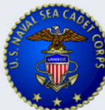
DESERT EAGLE SQUADRON ESCONDIDO BATTALION TRAINING SHIP KIT CARSON US NAVAL SEA CADET CORPS