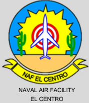
NAVAL AIR FACILITY EL CENTRO