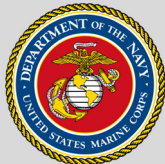
U.S. Marine Corps