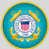
U.S. Coast Guard