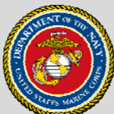
U.S. Marine Corps