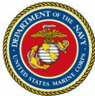
U.S. Marine Corps