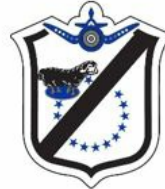
USMC MARINE FIGHTER ATTACK SQUADRON VMFA-214