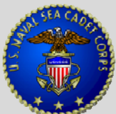
DESERT EAGLE SQUADRON ESCONDIDO BATTALION & TRAINING SHIP KIT CARSON US NAVAL SEA CADET CORPS