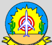
NAVAL AIR FACILITY EL CENTRO