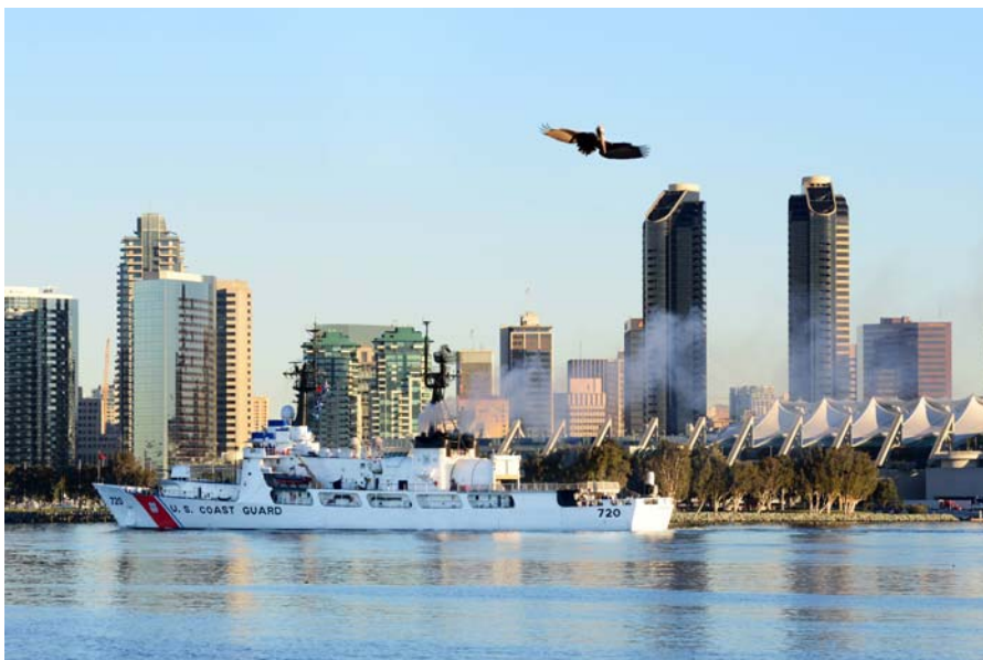
The Coast Guard Cutter Sherman departs San Diego for its final time as the cutter and crew depart their current home port and steam toward their new home port in Hawaii.

The Sherman moved from Alameda, Calif, to San Diego in May 2011 when the Coast Guard Cutters Chase and Hamilton were retired from service. Fair Winds and Following Seas USCGC Sherman and Crew.