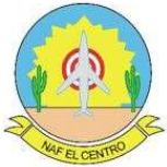
NAVAL AIR FACILITY EL CENTRO