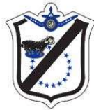
USMC MARINE ATTACK SQUADRON VMA- 214