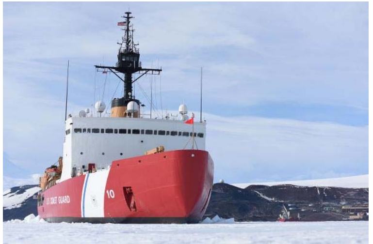
The Coast Guard Cutter Polar Star is hove-to in McMurdo Sound, Antarctica, fast ice near the National Science Foundation's McMurdo Station, Feb. 2, 2016.