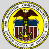
U.S.-flag Merchant Marine